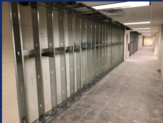
Wall Framing in Area A